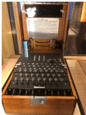
Original German Enigma Machine