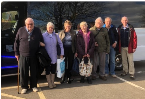
The Veterans' Group

Set in the grounds of the original Victorian Bletchley Park Mansion, the various huts and buildings have been restored to show how the 'intelligence factory' operated at an industrial scale with a multi-skilled workforce of some 9,000 people, all of whom were sworn to absolute secrecy. The exhibits include an original Enigma machine and a replica of Turing's 'Bombe' machine, which was instrumental in speeding up the daily search for Enigma cipher keys, and which featured in the film 'The Imitation Game' starring Benedict Cumberbatch as Alan Turing. The Bletchley Park exhibitions also link to modern-day data and intelligence gathering by GCHQ, the modern equivalent of the WWII Government Code & Cypher School.