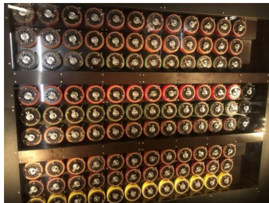
Replica of Turing's Bombe Machine

The work carried out at Bletchley Park during WWII was fundamental to the survival of Britain and the free world. It is now a fascinating and internationally renowned heritage attraction with more than 250,000 visitors per year. As everyone agreed, it was a privilege to walk in the footsteps of those who contributed so much to the Allied victory.